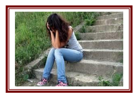
ICS Ashcroft: Together for Safety: Ashcroft's Violence Intervention Project

Merritt Children & Youth with Special Needs Merritt Family Preservation Merritt Family Service Program Merritt Supervised and Supportive Visitation Healthy Beginnings Safe Spaces Teen Centre Youth Justice